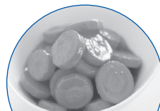
Cooked Orange Vegetables (Carrots, Sweet Potatoes)