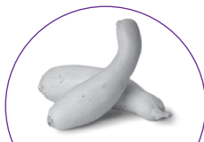
Cooked Yellow Vegetables (Summer Squash)