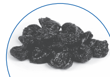
Cooked or Dried Non-citrus Fruits (Berries, Pears, Prunes)