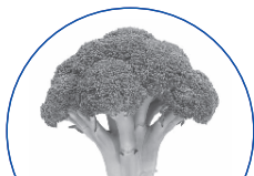
Cooked Green Vegetables (Broccoli, Spinach, Collards)